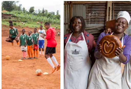
Girl's empowerment through sports program grows.