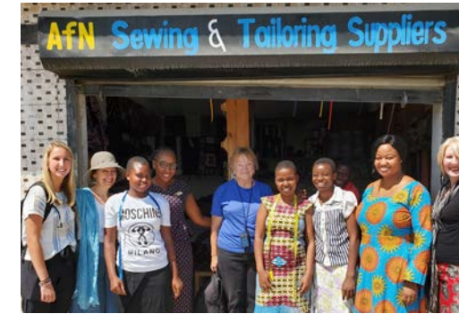
The African Road community grows: 2019 learning trip team visits the New Hope for Girls Sewing Shop.