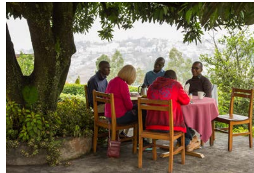
Creating a VICOBA facilitators' manual.