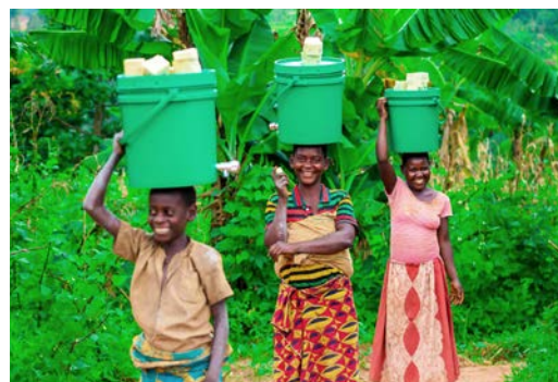
The ASSEJEBE team worked to bring soap, hand-washing stations and COVID prevention education to 600 families in 10 villages.