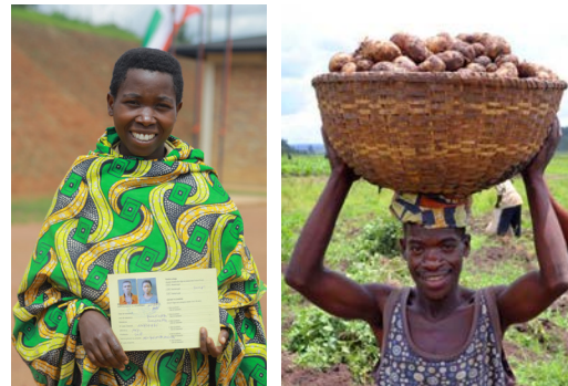
ID cards and access to health care = dignity and progress.