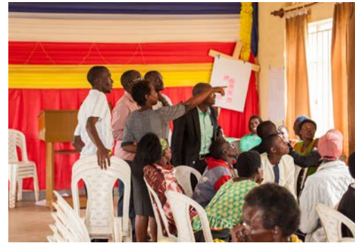
A new VICOBA hub and training in Rwanda for 75 REACH Unity group members.