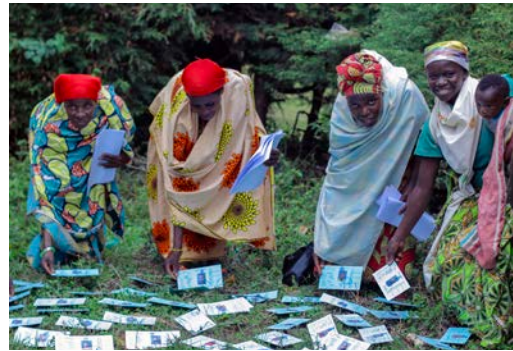
1,200 ID Kits for Batwa indigenous people.