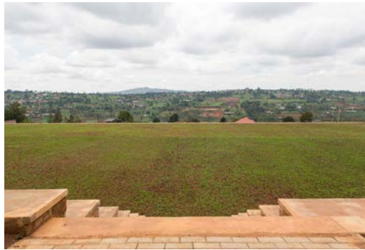
Togetherness Cooperative Phase I soccer field completed!