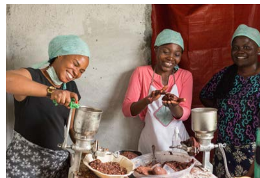
Putting VICOBA to work: the Women of Goma expand their chocolate business.