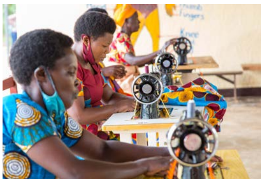
40 women in the All Soul's Cooperative gain new skills and an income-producing business.