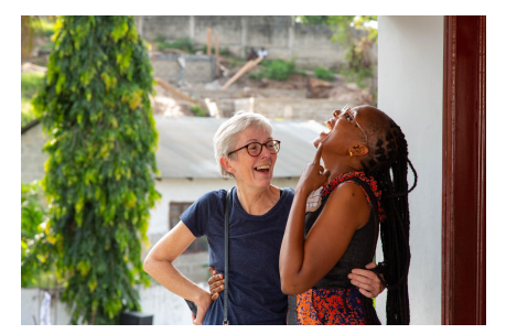
<u>This short film</u> tells the story of New Hope for Girls and shares the next step this incredible family is ready to take with your support.